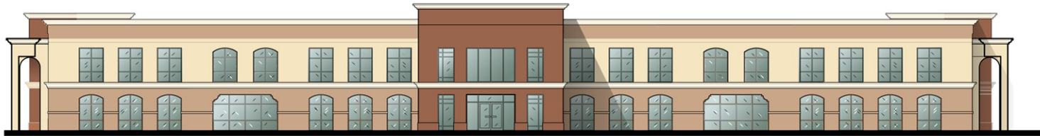
TYP. COURT-YARD ELEVATION SCALE: 1/8"=1'-0"