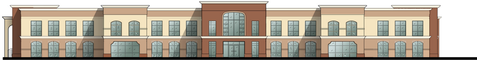
EAST (FRONT) ELEVATION SCALE: 1/8"=1'-0"