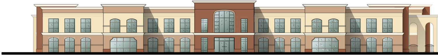
WEST (REAR) ELEVATION SCALE: 1/8"=1'-0"